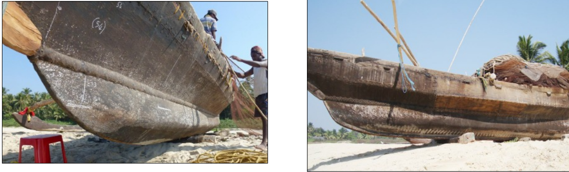
Figure 5. a) an outboard padded seam between underbody and flaring garboard; b) the flare of the garboard varies and may with age, deform under the weight of nets and need to be renewed. Benaulim. Author.

Within living memory a maximum of three strakes was employed to create the form, even of a pirogue 18m long (Fig. 6). In recent years the shortage of large trees and substitution by saw-mills of boards in standard widths have necessitated replacement with more and narrower strakes during successive repairs.